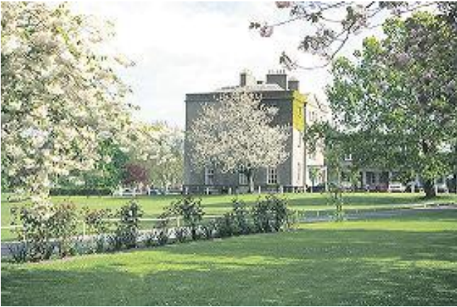
Newtown School