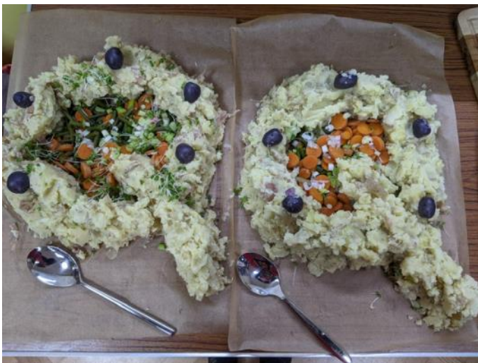
Items from the meal, including presentation of food as a smiley face, and as a Quaker 'Q'.