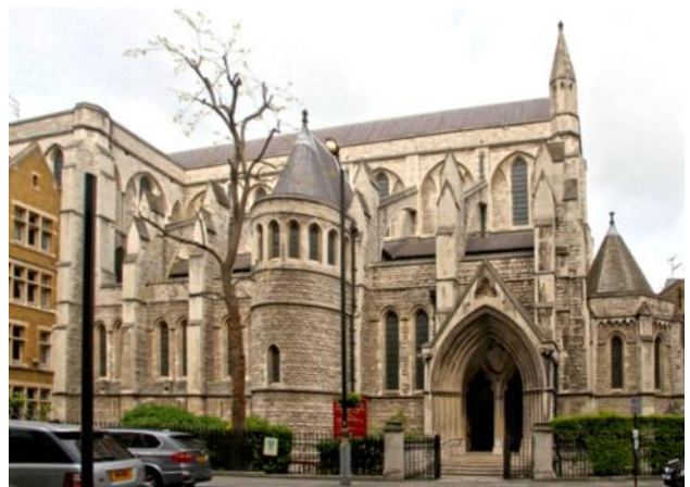
Spanish Place Church

I was introduced to a priest who gave me an hour's lesson in Catholic beliefs every week. I listened and tried to take on board all I was told. Next step was Baptism at Spanish Place – a Catholic church frequented by the famous and celebrated. I had become a “convert”. Goodbye Quakers – I never gave them another thought. I had fallen into the lap of the vast Roman Catholic church. I wasn't pushed, I fell. It was what I wanted.